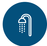
Hot Water System Heater (Shower)