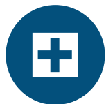
USCG Essential Safety Kit