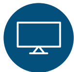
LED 24" TV Set And Mounting