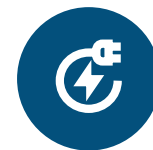
Shore Power Cord 50A