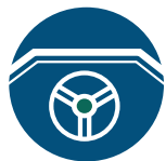
Leather Cover Panel (Complete Dashboard & Helm)