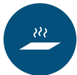
Induction Electric Stove (Cabin)