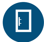
Isotherm 65L Fridge 12v