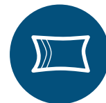
Design Items Set (Pillows, Beddings, Cushions, Towels, Accessories)