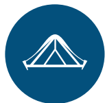
Bow Tent (Bimini Top On Bow)