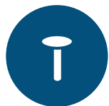
Bar Stools/Chairs on Stern (Kit Of 2 Banquets)