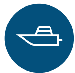
Cradle For Transport