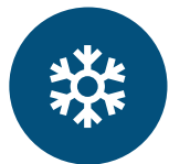
A/C System 6,000 BTU (Cockpit)