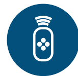
Head Lights w/ Remote (Cruising Spotlight)