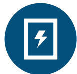
Galvanic Isolator (Electrical Protection)