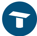
Heavy Duty Folding Table (Cockpit)