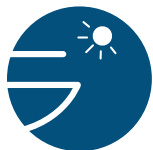
Electric Aft Shade (Stobag)